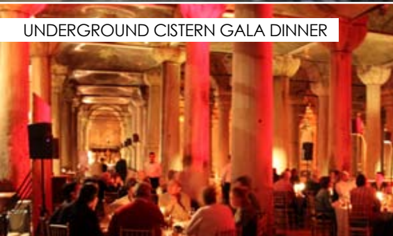
UNDERGROUND CISTERN GALA DINNER