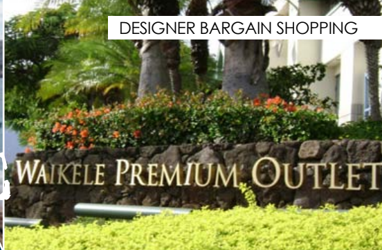
DESIGNER BARGAIN SHOPPING